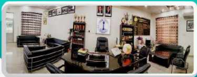
Office of the Principal