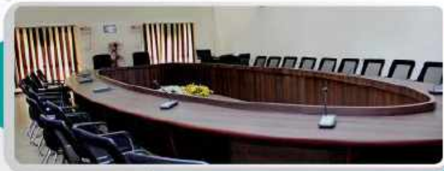
Conference Hall of D.A.V. College Managing Committee