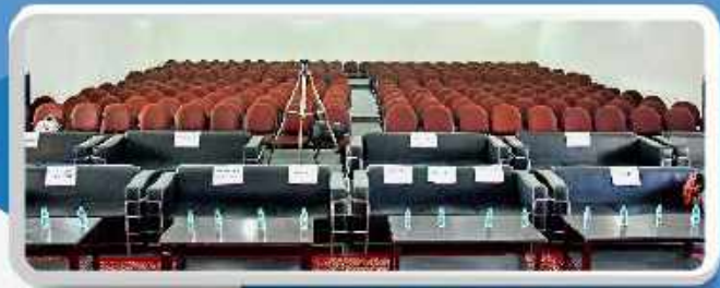
View of College Auditorium