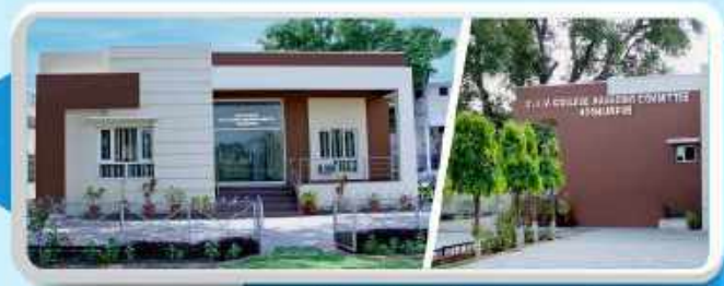
Office, D.A.V. College Managing Committee